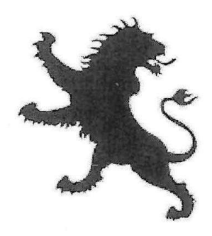
Trade Mark Application No. 56703

VIVO MOBILE COMMUNICATION CO., LTD., 283#, BBK Road, Wusha, Chang'An, Dongguan Guangdong, China - 17/10/2017. Address for service is: Firstmark Ltd., Sofia House, 3rd Floor, 48 Church Street, Hamilton HM 12, Bermuda.