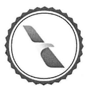
Trade Mark Application No. 56584

Class 39: Provision of travel data; provision of travel information; provision of transportation information; providing flight arrival and departure information; providing an online computer database in the field of travel and transportation data; providing an online computer database in the field of travel and transportation information; physical storage of electronically stored data; all included in Class 39.