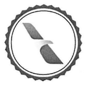
Trade Mark Application No. 56583

AMERICAN AIRLINES, INC., 4333 Amon Carter Blvd., Fort Worth, Texas 76155, United States of America - 14/11/2017. Address for service is: Cox Hallett Wilkinson Limited, Cumberland House, 1 Victoria Street, P.O. Box HM 1561, Hamilton HM FX, Bermuda.