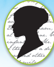
MARY PRINCE c. 1788–