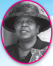
DAME LOIS BROWNE- EVANS, DBE, JP, LLB 1927–2007