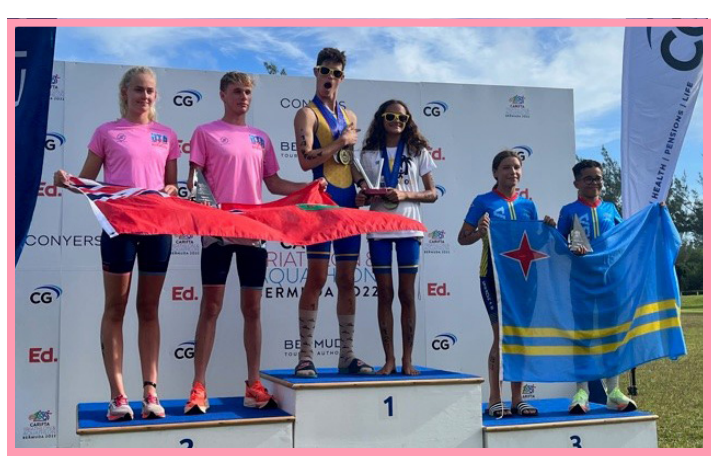
2022 Bermuda Carifta Games

CARIFTA – The 4th Annual CARIFTA Triathlon, Aquathlon, and Mixed Team Relay (MTR) Championship took place in November at Clearwater Beach, Bermuda. The island welcomed over 100 athletes from around the region along with officials and supporters from the regional triathlon federations. This is the first time that the event was held in Bermuda. Teams were registered from Antigua and Barbuda, Aruba, Bahamas, Barbados, Grenada, Jamaica, Puerto Rico and Trinidad and Tobago and 39 athletes from Bermuda.