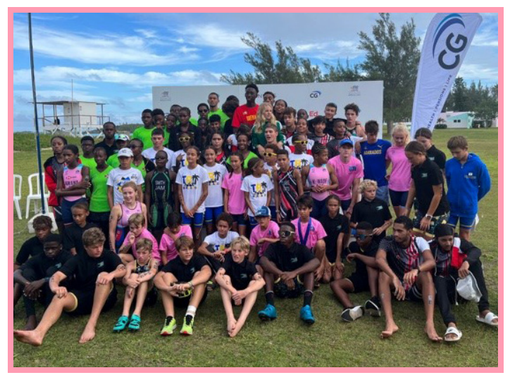
2022 Bermuda Junior Carifta Athletes