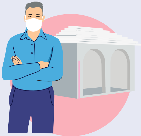
While taking public transport or in taxis

If you leave the house to purchase essentials or for work: Wear a mask