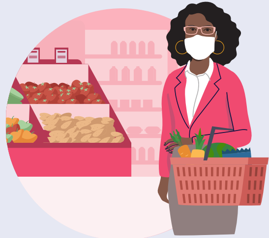
At the grocery store

You do not need to wear a mask when at home, when exercising or if a child under the age of 2