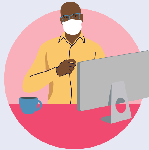
Those performing backend functions (e.g. data entry, payroll etc.)

If you leave the house to purchase essentials or for work: Wear a mask