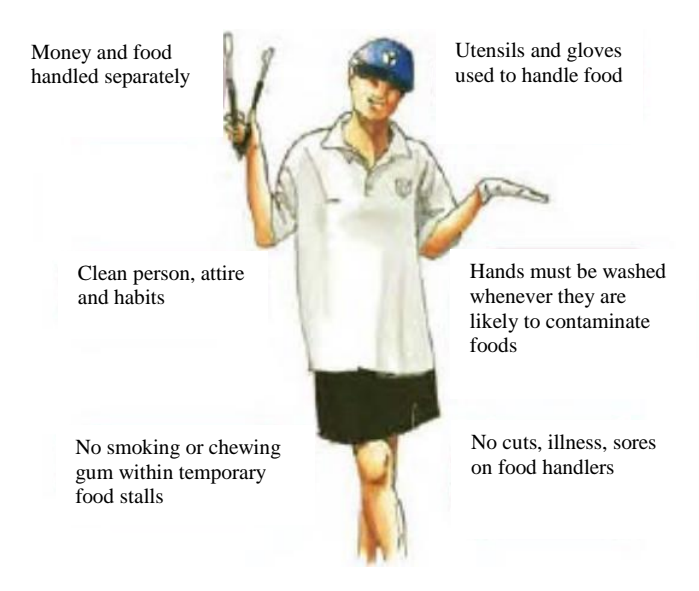
Fig. 2 Illustration of a Food Handler

Note: Uniform or apron shall be worn while working in food stalls