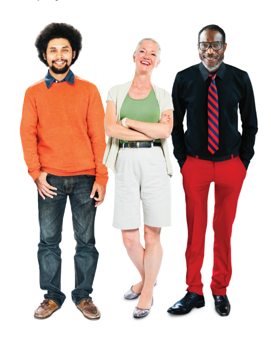
"Know your rights as an employee."