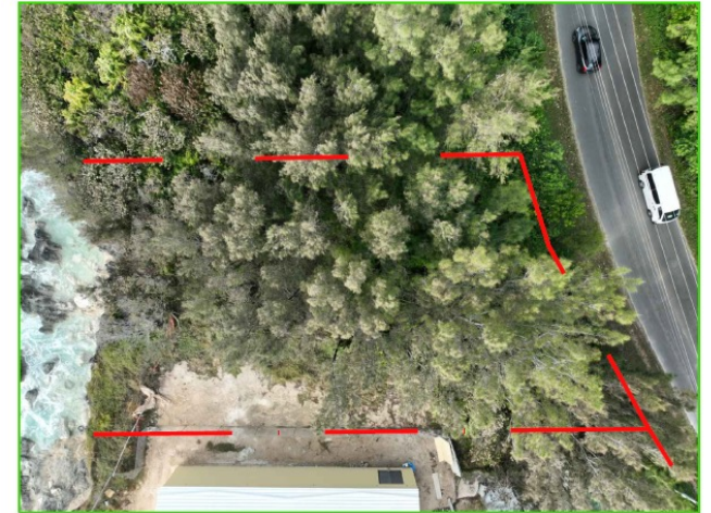
AERIAL PLAN VIEW SHOWING THE CURRENT VEGETATION (BOUNDARY IN RED) - NORTHERN BOUNDARY POPULATED W/ NATIVE, ENDEMIC & ORNAMENTAL PLANTS - COASTAL BOUNDARY POPULATED W/ NATIVE & INVASIVE PLANTING - CENTRAL PORTION POPULATED W/ MAINLY INVASIVE UPPER STOREY & LOWER STOREY PLANTS