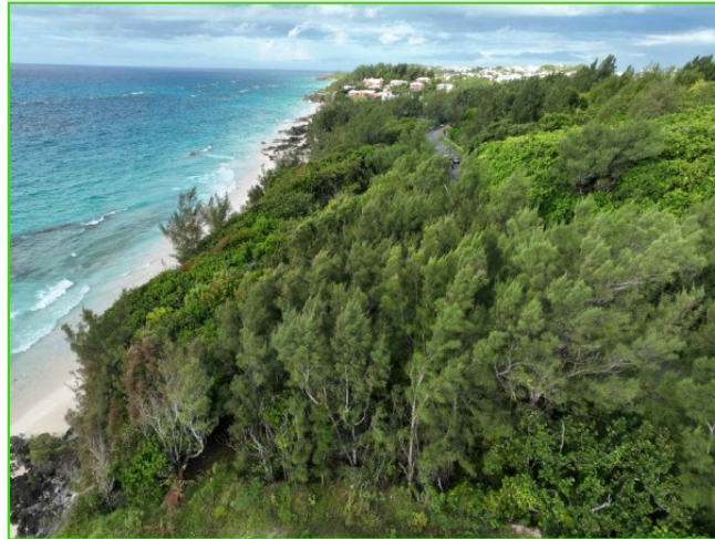
AERIAL VIEW WEST SHOWING THE CURRENT VEGETATION - CASUARINAS DOMINATE THE AREA