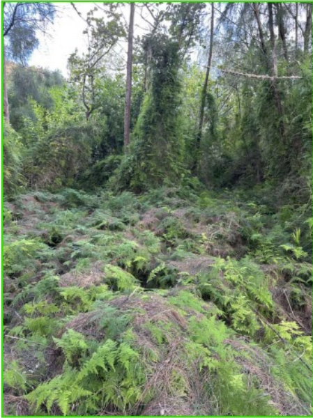
EXISTING CONDITION OF THE CENTER OF THE WOODLAND RESERVE - ASPARAGUS WEDDING FERN - MORNING GLORY