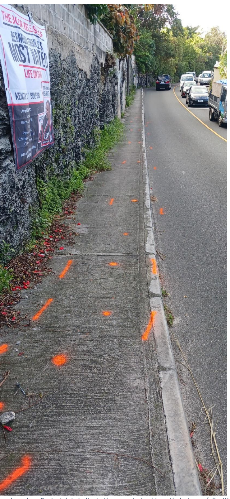
Figure 1 - Belco Markings from nearby pylon. Central dots indicate the expected cable path, but may fall within inner and outer boundaries which are also marked.