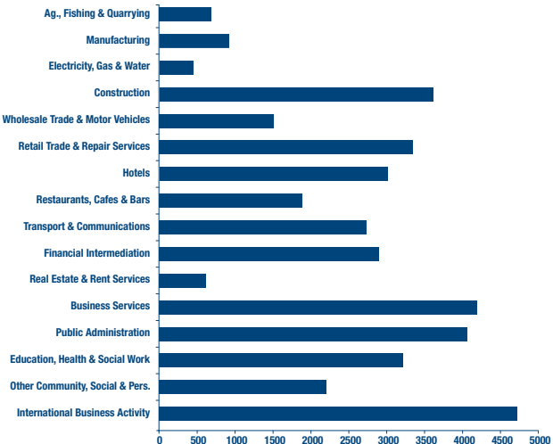
Employment 2007 (Jobs by Industry)