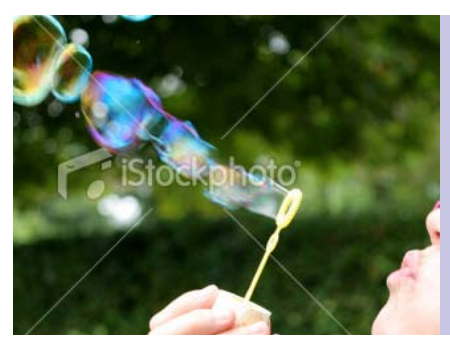
9% of adults and 19% of 0-10 year olds have asthma in Bermuda

The global prevalence of asthma ranges from 1% to 18%, and there is good evidence that it has been increasing in some countries.<sup>40</sup> In Bermuda the 2006 Health Survey found that 9% of adults stated that they currently had asthma. More women (12%) reported having asthma than men (6%), and young adults aged 18 - 34 years were more likely to report currently having asthma (14%) than any other age group. No differences were found by race, education or income.<sup>41</sup> In children asthma prevalence is higher. According to parental reports in the 2006 Health Survey,