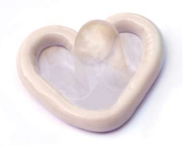
In 2006, 6% of adults reported having more than one sexual partner; of these, only 65% reported using a condom

The incidence of STIs in Bermuda has increased since 1999<sup>36</sup>. While in that year there were a total of 461 STI notifications, in 2005 there were 642 notifications overall<sup>37</sup>. Cases of gonorrhoea, herpes, syphilis and NGU/NSU either remained constant or decreased in this period. The increase observed has been exclusively in cases of chlamydia (223 cases in 1999 to 512 in 2005), which may be due to the introduction of more sensitive testing. HIV and AIDS cases have decreased in this period, from 20 cases of HIV in 1999 to 11 in 2005; and from 19 confirmed cases of AIDS in 1999 to just 6 in 2005<sup>38</sup>. Thanks to progressive treatment interventions, AIDS is no longer a major cause of mortality in Bermuda, but it was responsible for 0.7% of deaths in 2005.