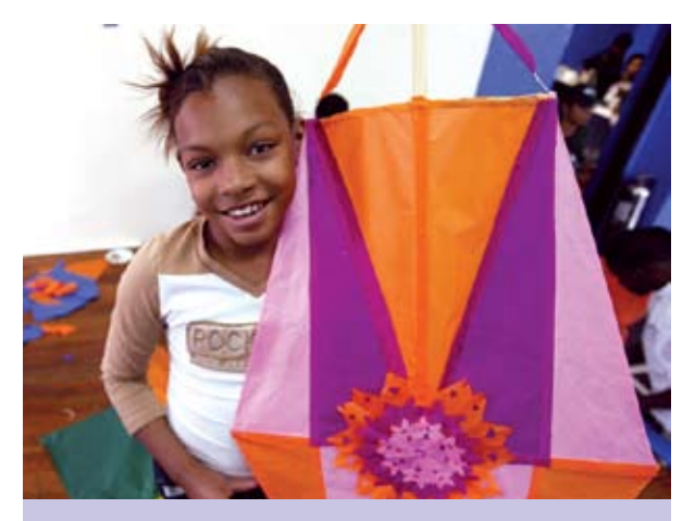
The promotion of health is fundamental to Bermuda's prosperity

Bermuda currently enjoys a relatively good health status; however, this cannot be taken for granted and recent trends indicate a worsening of the population's health. This must be halted. While many sectors and organisations in Bermuda are already working to improve the population's health through preventive measures, our efforts would yield greater results with more coordination.