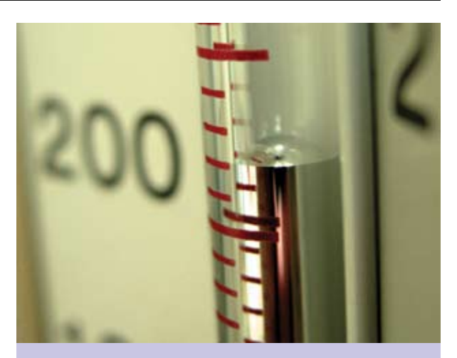
25% of adults in Bermuda have high blood pressure and 34% have high cholesterol.

Diseases of the circulatory system are the leading cause of death in Bermuda. In 2006 41% of all deaths were due to circulatory problems. In the 1999 Adult Survey 5% of respondents reported having high blood pressure and 2% reported having high blood cholesterol; however, by the 2006 Health Survey 25% reported high blood pressure and 34% reported high cholesterol. Most high income countries face similarly high and increasing rates of cardiovascular disease. It is the number one cause of death and disability in Bermuda, the U.S. and most European countries. By the time that heart problems are detected,