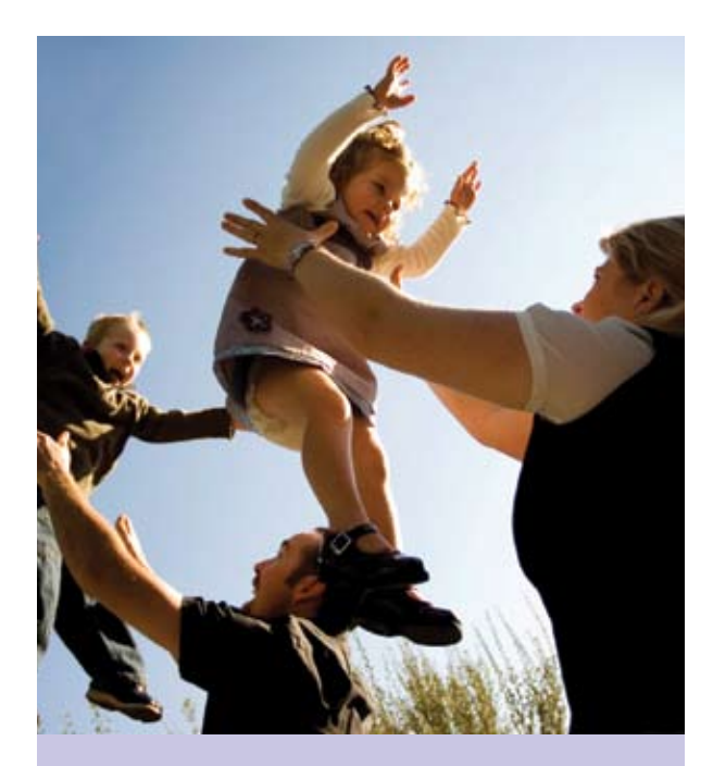
Action plans will yield greatest effectiveness if they are developed on sound foundations, based on the best available evidence, and are continually evaluated and assessed.

Importantly, action plans should be developed and implemented collaboratively, but it is recommended that a 'lead agency' be identified for each goal, as this will ensure that action takes place and is continually monitored. Committees and task forces are not recommended as suitable owners of action plans, as their longevity is tenuous and their accountability minimal. However, committees or working groups are an ideal setting to bring together partners to develop action plans and follow-up implementation.