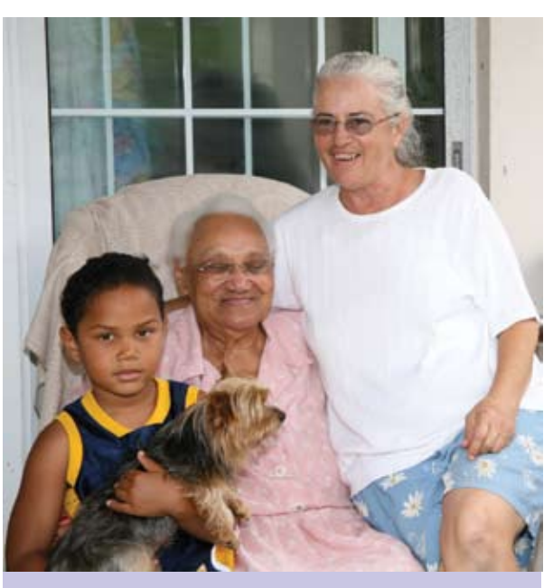
At the 2000 census 11% of the population was aged over 65, and over a third of persons with disabling conditions were seniors

Seniors can benefit tremendously from health promotion interventions. Therefore, this goal focuses on promoting health and improved quality of life through screenings, activity and support