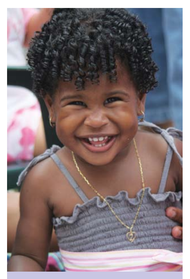
The National Health Promotion Strategy provides the shared vision; now we must work together to achieve shared results and a healthier Bermuda for all.

Action plans must be the next step, and this section has provided a basic blueprint to develop and implement them. With agreement on a shared vision the focus can move to all public health partners contributing tangible action to achieve a healthier future. The Health Promotion Office of the Department of Health will retain principal responsibility for monitoring and reporting on progress on the National Health Promotion Strategy objectives. Nevertheless, collaboration and partnership with and between all stakeholders are the backbone of the strategy, and the guiding principle for development and implementation of action plans. The National Health Promotion Strategy provides the shared vision; now we must work together to achieve shared results and a healthier Bermuda for all.