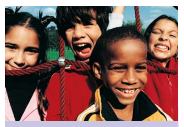
Health promotion is the most significant vehicle to rein in growing health problems

The Strategy aims to provide a unifying vision for a healthier Bermuda, and an agreed set of health promotion priorities for the country. But it is vital to remember that the National Health Promotion Strategy is part of a larger process. Action plans, implementation, monitoring and evaluation will bring about the tangible results in the population and it is that which will make a real difference to people's lives. For this reason, it is imperative to move swiftly to the next stage and develop goalspecific action plans to address what we have agreed to be the health promotion priorities for Bermuda. While the Department of Health is taking the lead in proposing the strategy, we are seeking for it to be endorsed by a wide range of partners who will share the vision and sign up to the joint responsibility for delivering action.