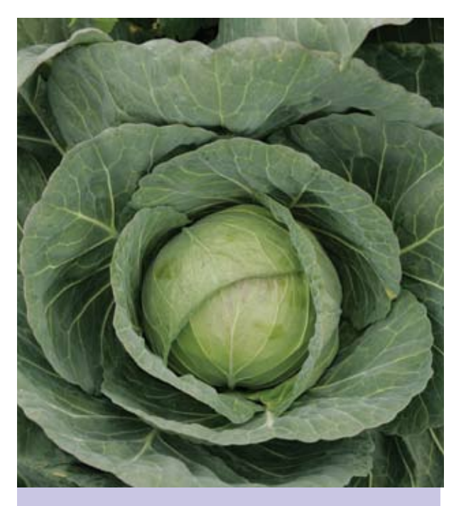
It is crucially important to identify the condition early, slow down its progress and minimise its impact on people's lives.

From a health promotion perspective, the aims of this goal are to encourage early identification of chronic kidney disease and educate patients on lifestyle changes that may prevent or delay adverse outcomes.