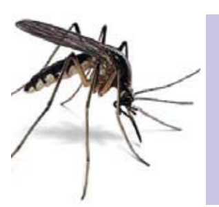
Communicable diseases can be rapidly spread if uncontrolled, or they can be reintroduced to the Island even after eradication

A century ago, communicable diseases were responsible for the majority of deaths in Bermuda and around the world. Extensive public health measures have brought many such diseases under control in Bermuda and eradicated some altogether, to the point that communicable diseases are no longer significant causes of death. However, there is no room for complacency with diseases of this nature, as they can be rapidly spread if uncontrolled, or they can be re-introduced to the Island even after eradication. Although the incidence of food borne illnesses in Bermuda is relatively low, this is a consequence of extensive efforts to promote and ensure appropriate food handling and treatment of drinking water; efforts that must be acknowl-