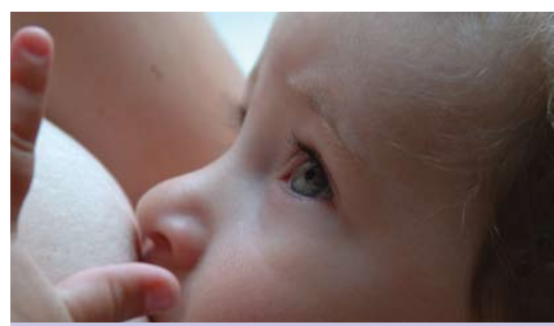
Give me a child when he is seven and I will show you the man

From a prevention perspective, developmental screening and breastfeeding are key to promoting healthy childhood. Developmental screening is an effective way to identify children who should receive more intensive assessment, diagnosis or treatment before difficulties become severe or entrenched. And breastfeeding decreases the incidence and/or severity of a wide range of childhood diseases<sup>62, 63</sup>, including some of Bermuda's most prevalent child health problems, and is therefore an essential factor in promoting healthy childhood.