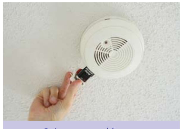
Being prepared for any emergency in any day of ordinary life is more likely to have an impact on ourselves and others.

Over the last few years we have seen some of the worst hurricanes and storms this century wreak havoc and destruction and caused loss of life in the Caribbean Islands and the U.S. southern-most and Gulf area states. Most Bermuda residents have experienced the destructiveness of storms and hurricanes personally, and there is broad agreement with the recommendation that preparedness is the best measure for coping with and recovering from such events. However, while hurricanes and storms can appear as the most likely potential disaster to the average island resident, it is important to remember that being prepared for any emergency in any day of ordinary life is more likely to have an impact on ourselves and others.