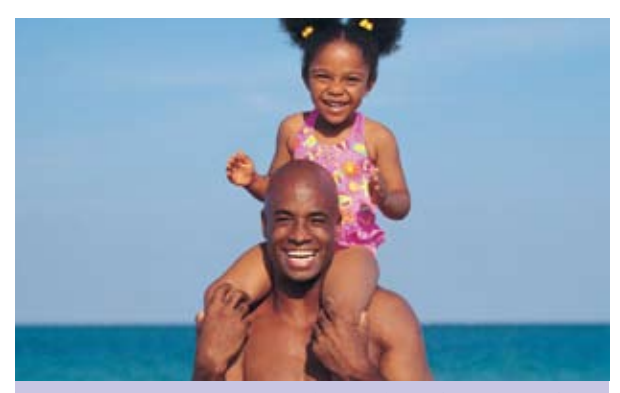
The majority of Bermuda residents live in family units; even people who live independently have family ties that play a part in their ordinary lives

In Bermuda 66% of all households can be said to be family households (25% two-parent, 20% adult couple, 11% one parent, and 10% extended family), while 28% are one person households, and 6% are households of unrelated persons<sup>44</sup>. In 2004 the average weekly household income for Bermuda was $2,043; however